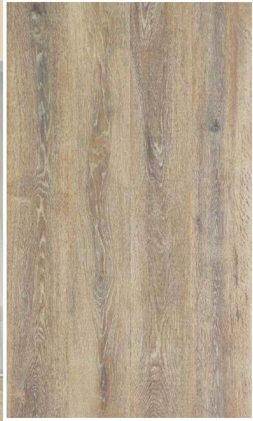
PWF - 1009 Wooden Series